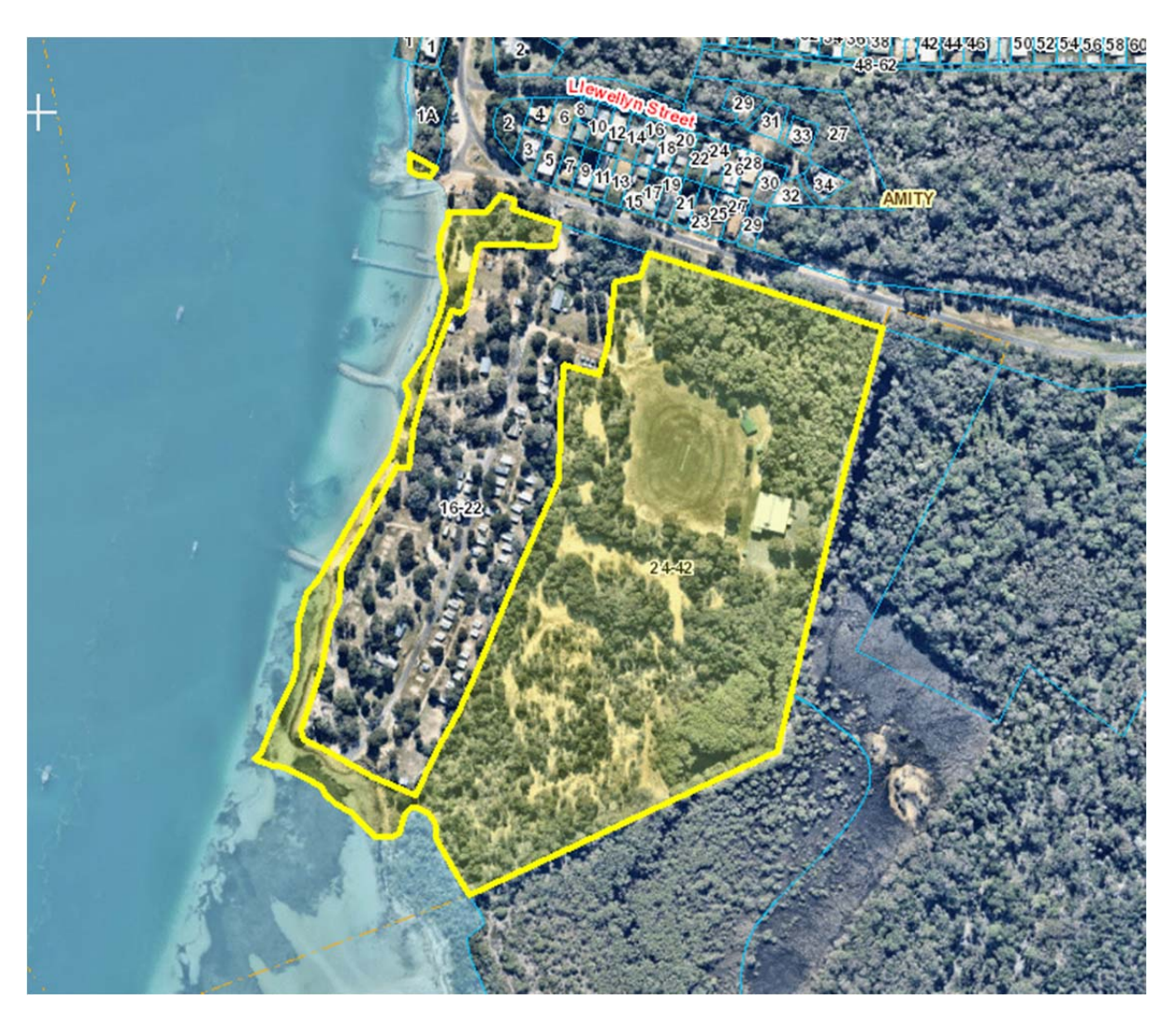
ATTACHMENT 1 AMITY POINT RECREATION RESERVE - 24-42 CLAYTONS ROAD, AMITY