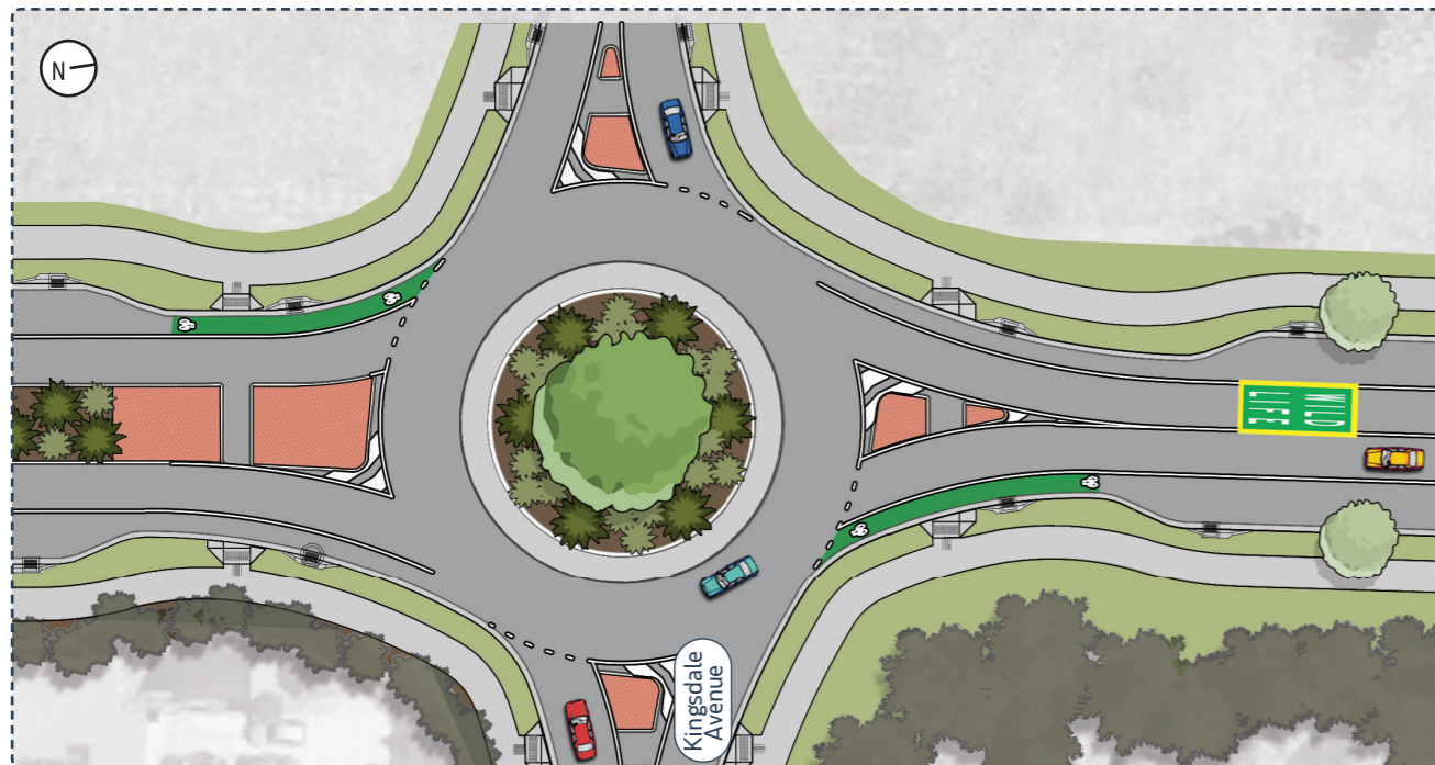
4 Roundabout #2 and Wildlife Threshold Pavement Markings