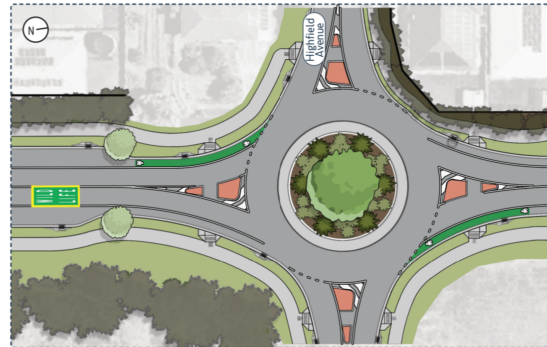
5 Roundabout #3 and Wildlife Threshold Pavement Markings

FOR INFORMATIONAL USE ONLY Note: This document is for informational use only. The proposed works plan reflects the intended direction for the subject area and is indicative in nature. Please be aware that modifications may occur throughout the construction process.