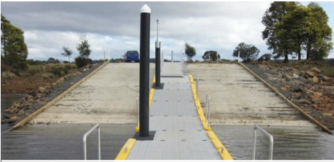
An example of the type of two-lane boat ramp with central floating walkway for Wallaby Road, Redland Bay, is in the conceptual planning stage.