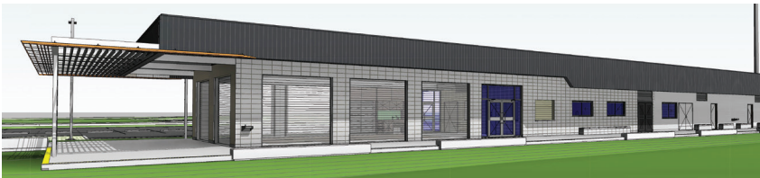
An artist's impression of the new clubhouse being built at the Charlie Buckler Memorial Sporting Fields.

A concrete rebound wall and slab has been installed at the park on Valley Way, for activities such as handball, tennis and similar games.