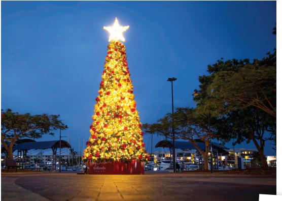
The Christmas tree at Raby Bay Harbour Park; the popular Point Lookout Markets on Minjerribah; and Christmas by Starlight when it was last held at Redland Showgrounds in 2019.