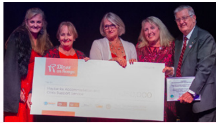
Maybanke Accommodation and Crisis Support Service being presented with a cheque for $250,000 in 2019.