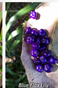
Blue Flax Lily