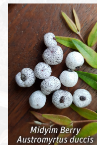
Midyim Berry Austromyrtus duccis

We will finish the year exploring the IndigiScapes Botanic Gardens and bush tracks and find seed and fruit ripe for collection.