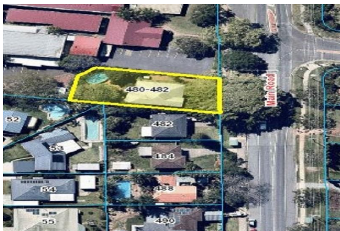
Red-e-map (RCC, 2016).