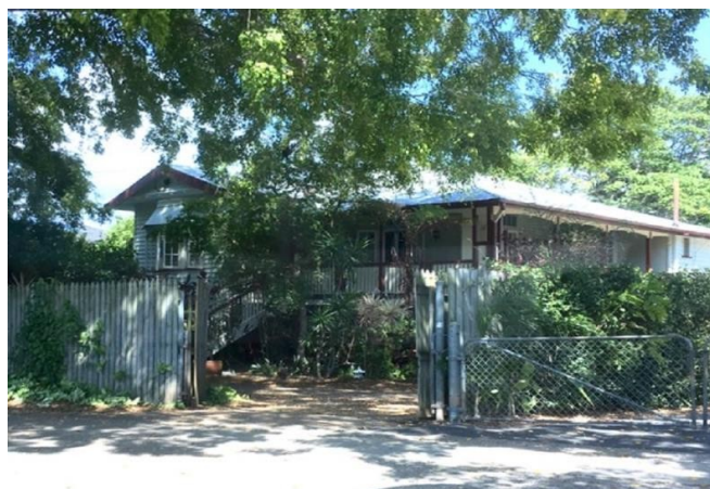
Wellington Point School Principal's House (Former), 480-482 Main Road (AHS, 2017).