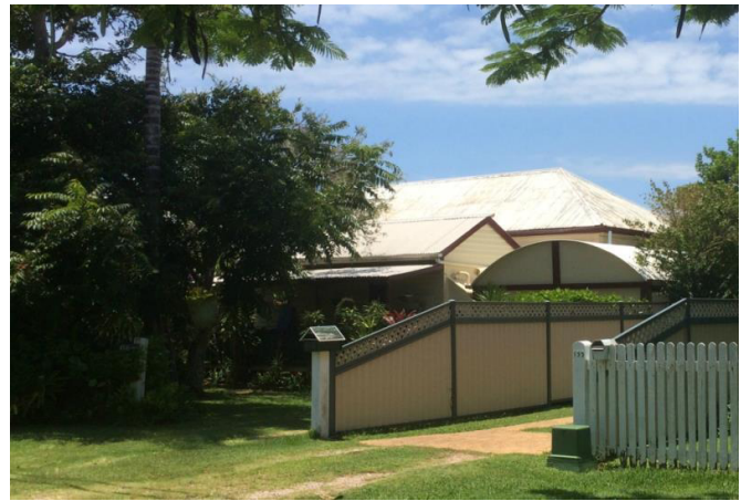
Residence, 157 Shore Street North, Cleveland (AHS, 2016).