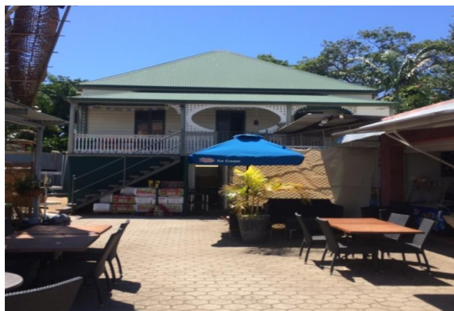
Residence, 16 Bingle Road, Dunwich (AHS, 2016).