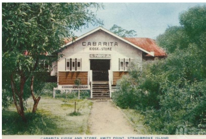
Residence, 2 Ballow Street, Amity Point (Queensland Places, 2016).