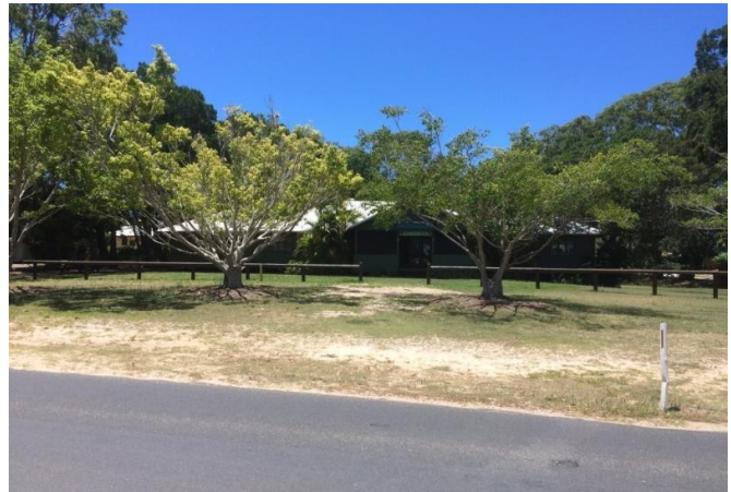
Residence, 2 Ballow Street, Amity Point (AHS, 2016).