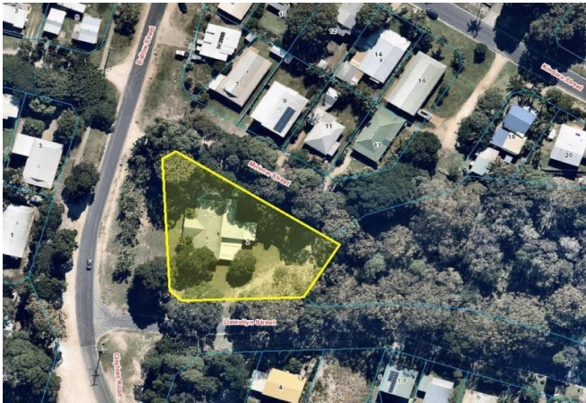
Red-e-map (RCC 2016).