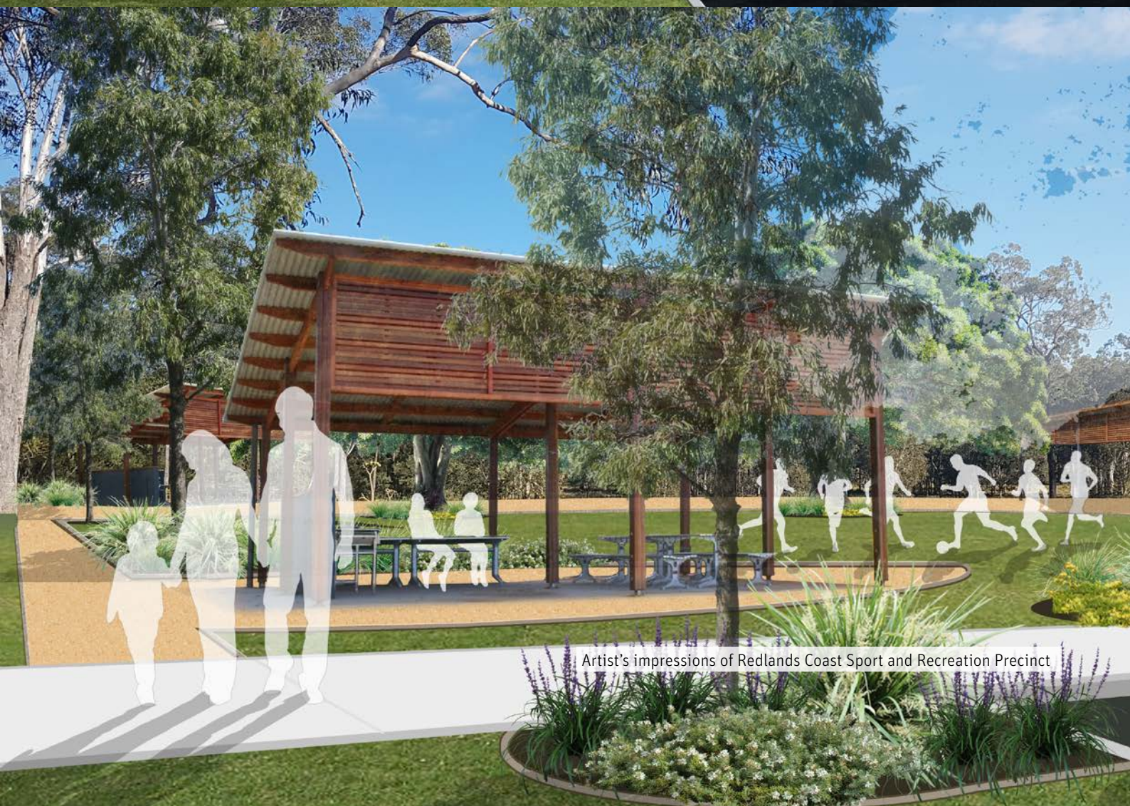
Artist's impressions of Redlands Coast Sport and Recreation Precinct