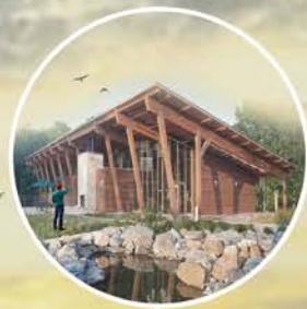
Artist's impression of Birkdale Community Precinct