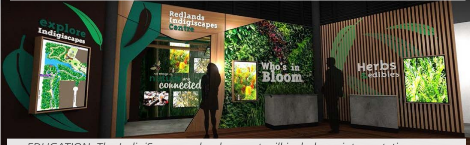
EDUCATION: The IndigiScapes redevelopment will include an interpretation space.