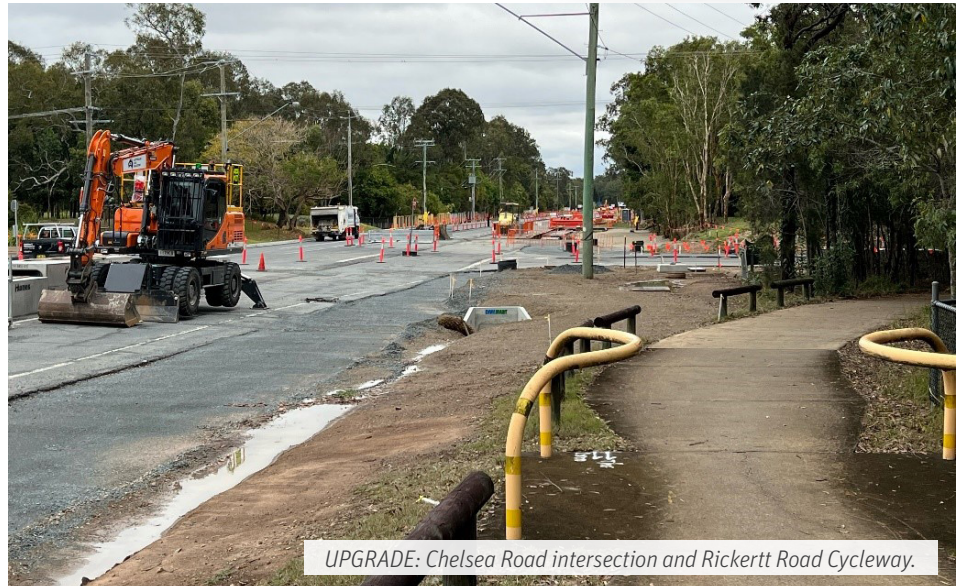
UPGRADE: Chelsea Road intersection and Rickertt Road Cycleway.

Connect with me on Facebook @CrPaulBishop