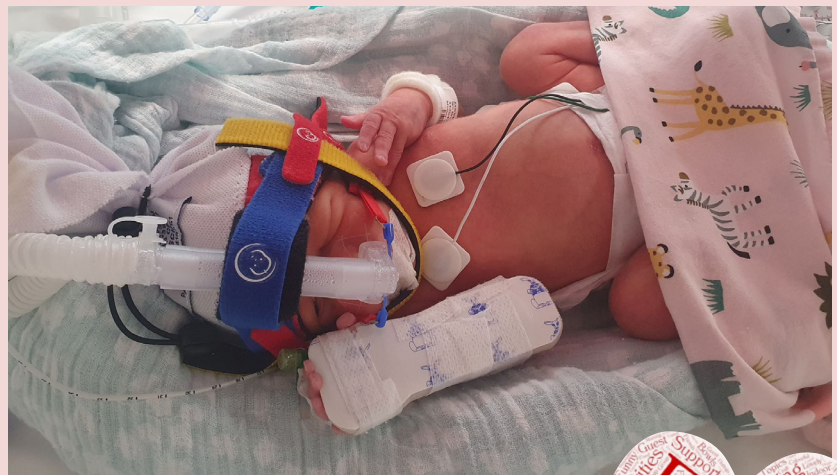
SUPPORT: Capalaba's Older Women's Network has been helping preemie babies at Redland Hospital's Neonatal Unit to bond with their mums.

Connect with me on Facebook @adelia4div97