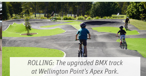
ROLLING: The upgraded BMX track at Wellington Point's Apex Park.