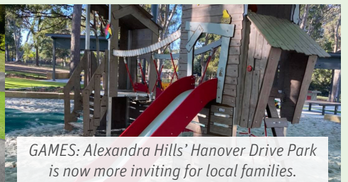
GAMES: Alexandra Hills' Hanover Drive Park is now more inviting for local families.