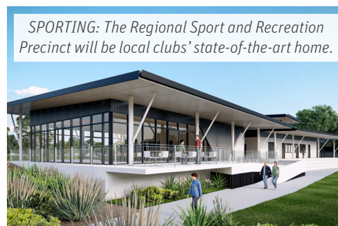
SPORTING: The Regional Sport and Recreation Precinct will be local clubs' state-of-the-art home.

These will include a regional-level play experience with water play and pump track; a kick-about area that could be used for events or fitness classes; boardwalks through wetland areas; and walking, horse riding and cycling trails funded by the Queensland Government's South East Queensland Community Stimulus Program in association with Council.