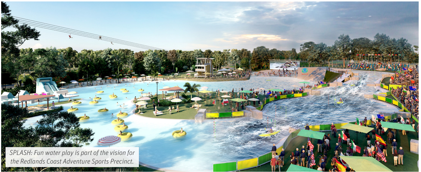
SPLASH: Fun water play is part of the vision for the Redlands Coast Adventure Sports Precinct.