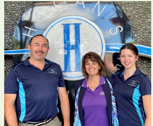
ON HIS WAY: Hogan's has just received a RSVP from Santa for a visit to their Christmas Eve family event.

markets, so watch this space. Tanja's will also be celebrating its 50th birthday, so stay tuned for the celebration of that milestone of one of our locals, plus our Australia Day games and celebration at the Point!