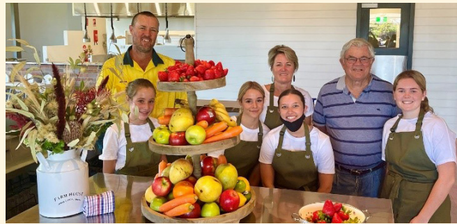
Wellington Point Farm Cafe.

I encourage everyone to buy locally for Christmas as this support will boost our local economy and local employment.