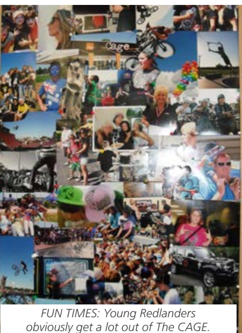
obviously get a lot out of The CAGE.

As a self-funded charity, all donations over $2 are tax deductible. If you would like to partner with The Cage and make a donation, you will be helping it to help others in the City. For more information, go to www.thecage.info