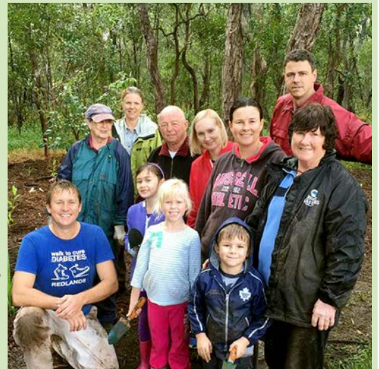
TAKING CARE: The Frank Street Bushcare volunteers are doing a great job looking after our natural environment.

Birkdale Bushland Refuge: Last Sunday, 8am, Burbank Road and Palgold Court.