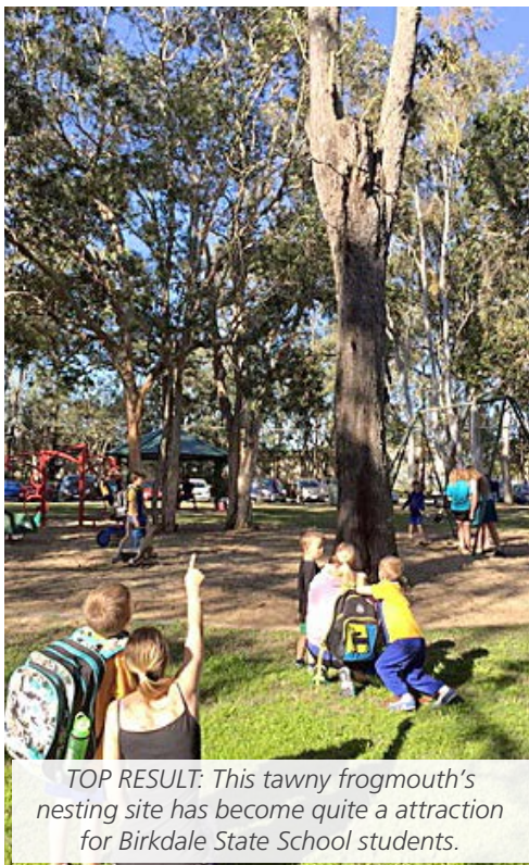
TOP RESULT: This tawny frogmouth's nesting site has become quite a attraction for Birkdale State School students.

8.30am, second Saturday of the month, Frank and Henry streets. Contact me for more information.