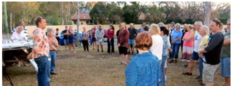
ENGAGED: Neighbours connecting with each other was a bonus to emerge from consultation on the draft City Plan.

Thanks to community members for assisting in raising awareness and expressing interest in coming together to learn about local events.