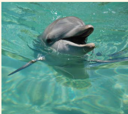
TOP SPOT: The view at Amity.

Since vehicle access to the site was closed in April, pedestrians have been welcome to walk to the beach through the campsite.