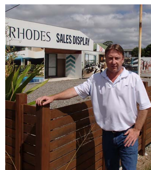
COMMITMENT: I continue working to get the best outcome possible for the Rhodes site on Mt Cotton Road.

I remain committed to trying to get a better outcome for the residents of the area surrounding the development and I'm currently trying to negotiate better outcomes with the new developer.