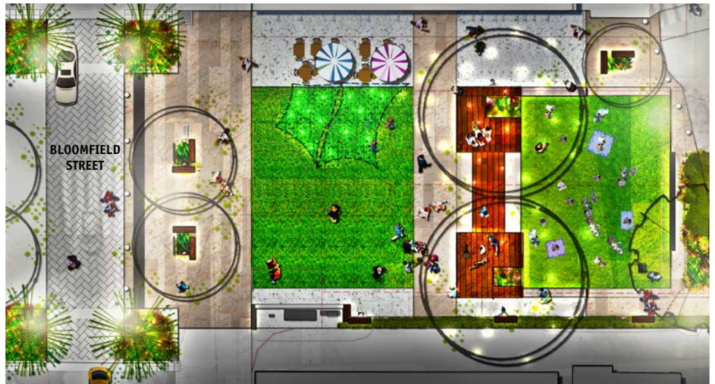
TOP SPOT: Bloomfield Park will become a flexible, family friendly space.

It will be interesting to see what local artists can come up with.