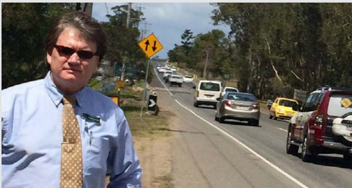
PEOPLE POWER: Your voice can help get busy Cleveland-Redland Bay Road upgraded to dual lanes.

You can put your name to the petition online at www.parliament.qld.gov.au . Go to "Work of the Assembly", then "petitions" and "current e-petitions". Look for petition 2311-14. You also can sign a hard copy at one of my regular information booths.