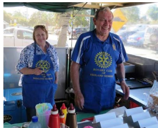
NOW WE'RE COOKING: Rotary's local volunteers are doing their bit to make a difference.

I have attended a number of the breakfast meetings and they are