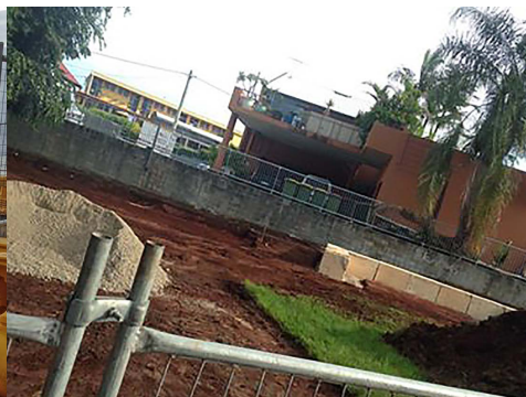
ON THE GREEN: Watch this space for a fun development at the Village Green.