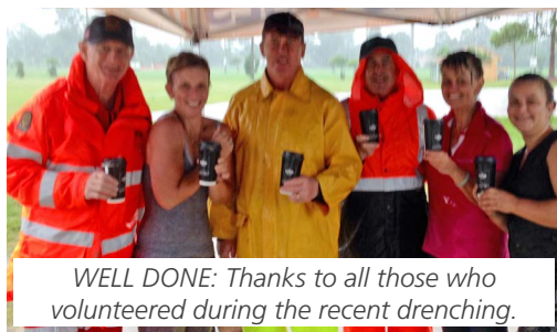
WELL DONE: Thanks to all those who volunteered during the recent drenching.