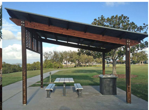
FAMILY TIME: The new barbecue facilities in Raby Esplanade, Ormiston.