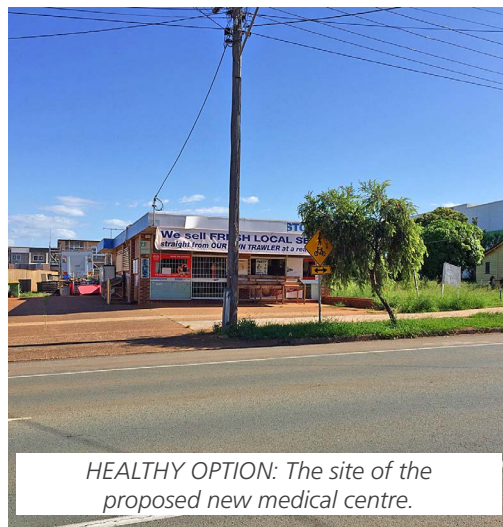
HEALTHY OPTION: The site of the proposed new medical centre.

Council has received an application to build a three-story medical centre on the land adjacent to Horizons Shopping Village at Wellington Point.