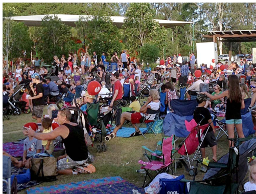
GREAT WORK: Mt Cotton Scouts worked tirelessly to supply food and drinks to the thousands who turned out for the Mt Cotton Christmas Party. This was doubly pleasing as a Councillor Small Grant supported the Scouts' fundraising for their new barbeque.