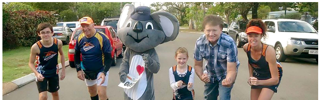
READY, SET: It is time to get your teams together and start training for this year's Run for Redlands 48-Hour Charity Festival and Koala Fun Run.

The State Government's contractors are making every effort to keep disruption to a minimum during construction but there may be short delays and inconvenience while the temporary bus stop is in use and the carpark partially closed.