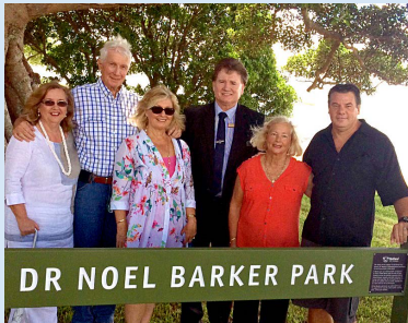
DR NOEL BARKER PARK