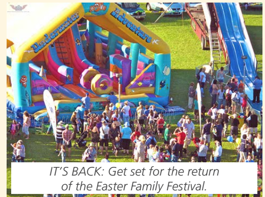
IT'S BACK: Get set for the return of the Easter Family Festival.

The Redlands Easter Family Festival will resume on 6 April at Cleveland's Norm Price Park after a year's break. The free family festival started back in 2000 and this year will take over the showgrounds with a host of sideshow stalls and rides, an animal farm, children's performers, free food and drinks and a variety of kids' activities, street theatre and other entertainment. It is expected to attract about 15,000 people, making it one the largest annual events in the Redlands. The show will open at 10am and run to 3pm. You will find the full details at www.redlandchurches.org .