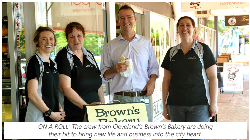
ON A ROLL: The crew from Cleveland's Brown's Bakery are doing their bit to bring new life and business into the city heart.

My hope is that Renew Cleveland will bring buildings to life again by