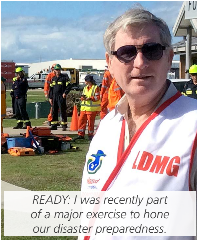
READY: I was recently part of a major exercise to hone our disaster preparedness.