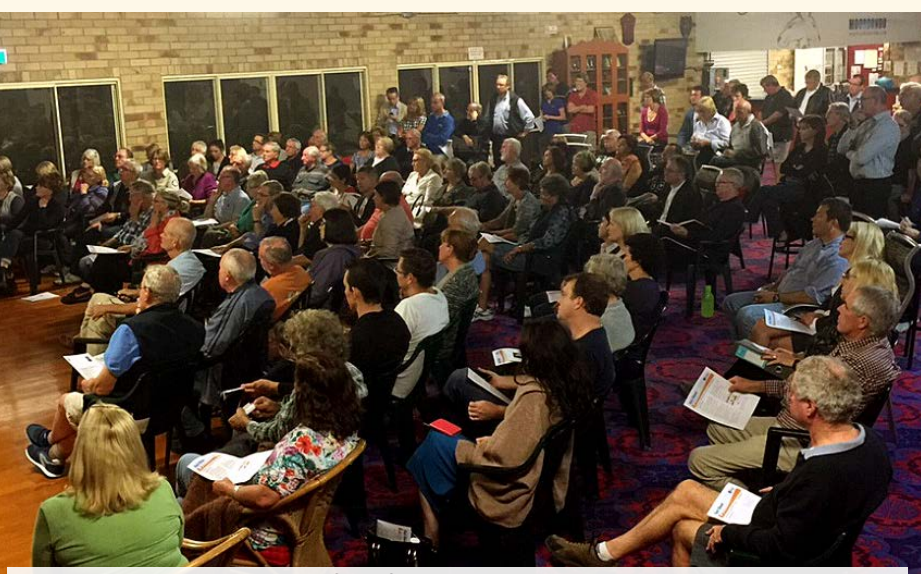
LOCAL VOICE: One of the four community meetings at Mooroondu Sport and Recreation Hub which were called to discuss the future of local impact-assessable developments.

Later this year, an "inquiry by design" process will be co-ordinated by planning officers, whereby community values and expectations will be considered. More details will be released soon.