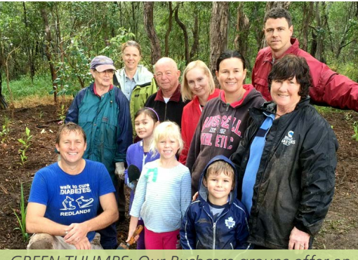
GREEN THUMBS: Our Bushcare groups offer an enjoyable way to care for our environment.

Would you like to assist one of the four dedicated local groups in our region which meet for two hours once a month to help our environment? Your contribution will help keep local vegetation healthy and weeds under control. If you value our environment, why not lend a hand? Contact me and I can introduce you to your local Bushcare group or go to our IndigiScapes centre's website at indigiscapes.redland.gld.gov.au