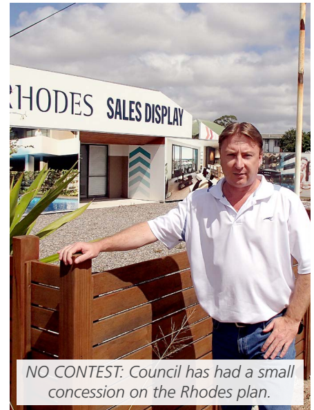
NO CONTEST: Council has had a small concession on the Rhodes plan.

I was able, however, to get an agreement from the developer and the Department of Transport and Main Roads to construct a left in/left out access directly on to Mt Cotton Road. This had not previously been a condition of the application. This will reduce some of the traffic impact on Holland Crescent and Aramac Court.