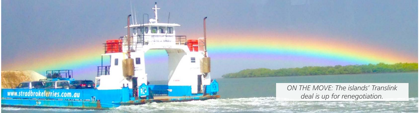
ON THE MOVE: The islands' Translink deal is up for renegotiation.

Our passenger ferry transport is part of a TransLink agreement which was initiated as a two-and-half-year trial.