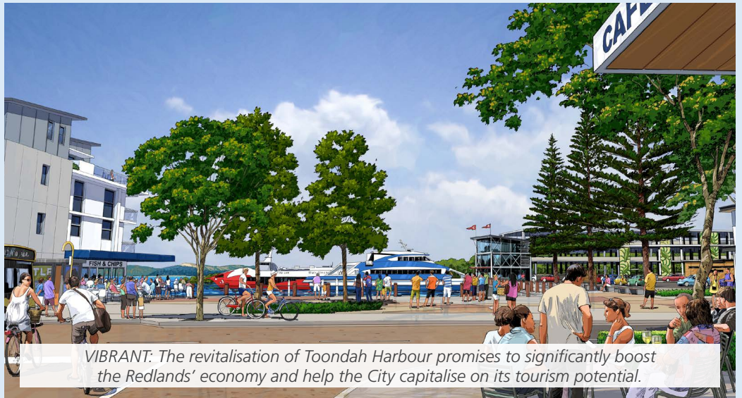
VIBRANT: The revitalisation of Toondah Harbour promises to significantly boost the Redlands' economy and help the City capitalise on its tourism potential.

All general Council inquiries can be made on 3829 8999.