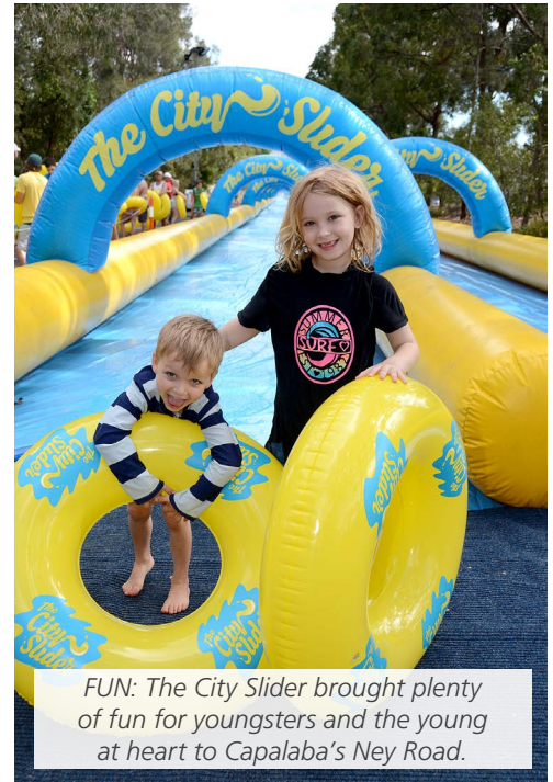
FUN: The City Slider brought plenty of fun for youngsters and the young at heart to Capalaba's Ney Road.