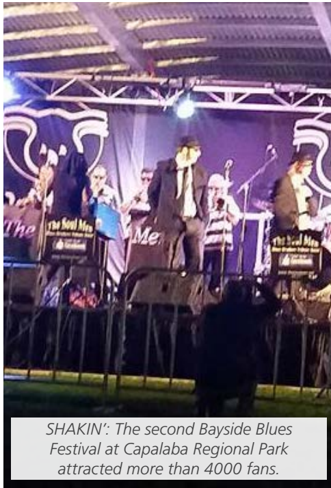
SHAKIN': The second Bayside Blues Festival at Capalaba Regional Park attracted more than 4000 fans.

Currently I'm working with a local jazz group and we are hoping to host a Christmas jazz concert on the new stage at Capalaba Regional Park on Saturday, 5 December. Watch my Facebook page for more details about this free, family day.