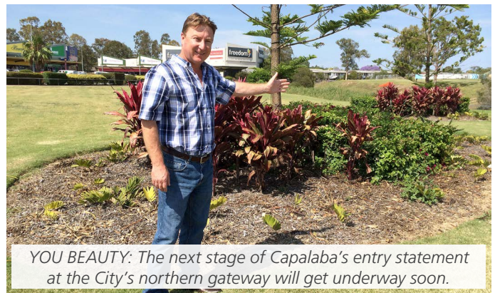
YOU BEAUTY: The next stage of Capalaba's entry statement at the City's northern gateway will get underway soon.

Meanwhile, Banfield Lane (behind KFC) is about to receive a huge upgrade with boulevard parking for about 50 cars, as well as a new footpath. It will be constructed from concrete to stop the land subsiding due to issues with the previous landfill.