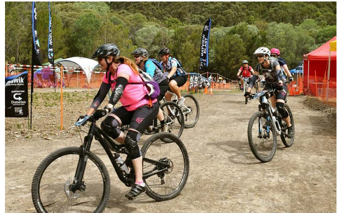
BIG BLAST: More than 500 competitors and their crews descended on Mt Cotton for the Bayview Blast mountain bike competition. Council is working to upgrade bike trails such as those in Days Road Reserve to cater for national championship events such as this and boost our economy.

Keep an eye on my Councillor Facebook page for updates.