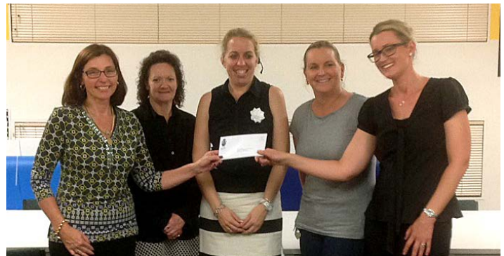
COMMUNITY: Mt Cotton Primary P&C Association was presented with a grant to help foster greater community use of the school hall.