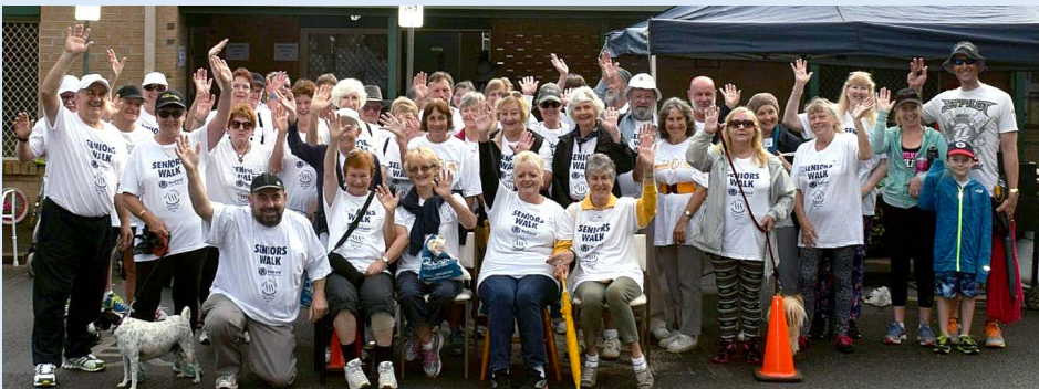
STRIDING OUT: This year's Seniors' Walk on Russell Island proved very popular.