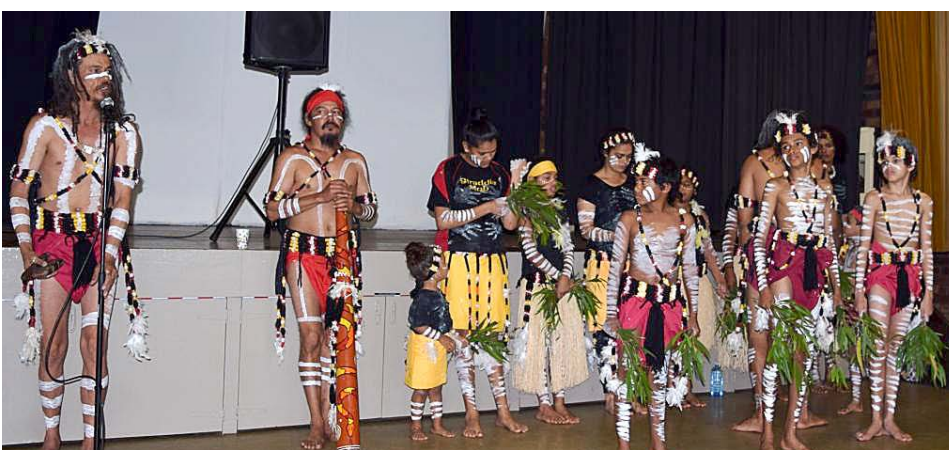
TURNING THE TIDE: The Quandamooka Dancers not only entertained but gave an informative presentation on the indigenous culture around our islands.