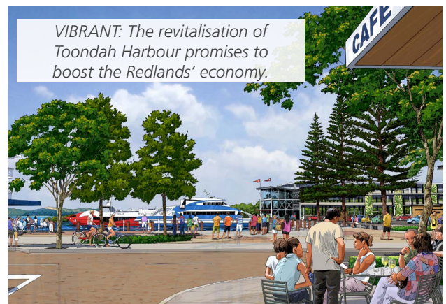
VIBRANT: The revitalisation of Toondah Harbour promises to boost the Redlands' economy.

Since the State Government formally endorsed the $1.3 billion Priority Development Area project in June, Walker Group has sponsored the Relish Festival at Raby Bay in October and the Island Vibe Festival at Point Lookout in October/November and launched a website www.toondah-harbour.com.au .