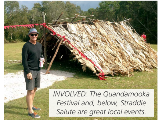
INVOLVED: The Quandamooka Festival and, below, Straddie Salute are great local events.

The fun and big sounds (and hair!) of Greazefest will descend on the Cleveland showgrounds from August 5-9 ahead