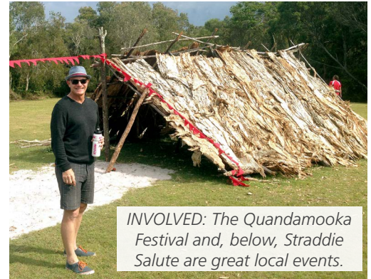
INVOLVED: The Quandamooka Festival and, below, Straddie Salute are great local events.

The fun and big sounds (and hair!) of Greazefest will descend on the Cleveland showgrounds from August 5-9 ahead