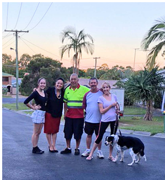
APPRECIATED: Residents of Leah Court, Wellington Point, are happy that their street has now been resealed.

Council is now entering the third year of a 10-year program to fix a backlog of road surfaces across the City. All up this financial year, $21 million was committed to upgrading roads, transport and footpaths across the Redlands.