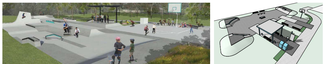
PLAYTIME: The planned Mt Cotton skate park and Redland Bay Teen Hangout.