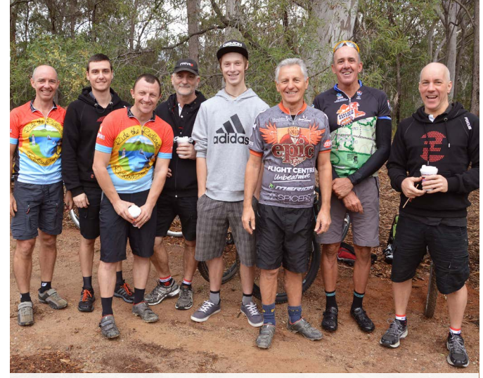
ON TRACK: More than 60 people celebrated the opening of new Redland Track Park trail head additions recently. The new trail heads provide shelter, bike racks, bike repair stations, maps and information, water and a place to meet.

The Budget also delivers a predicted fourth successive operating surplus while maintaining a low level of debt. We need to live within our city's means and I will not support