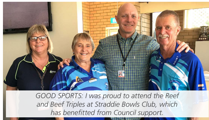
GOOD SPORTS: I was proud to attend the Reef and Beef Triples at Straddie Bowls Club, which has benefitted from Council support.