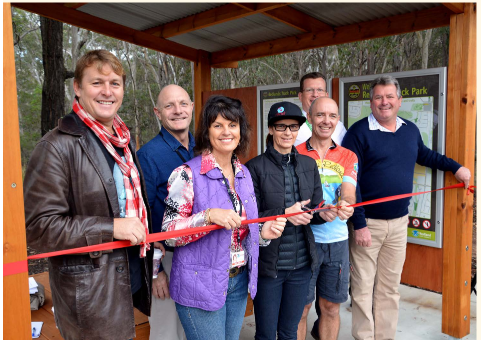
ON TRACK: I was pleased to join with neighbouring Councillors recently to celebrate the opening of new Redland Track Park trail head additions. The new trail heads provide shelter, bike racks, bike repair stations, maps and information, water and a place to meet.