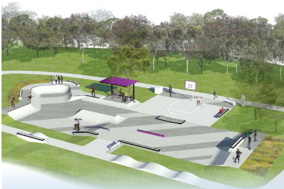
COMMUNITY: The new Mount Cotton skate facility promises to be a great facility for local youngsters. The design drawings above and below show a purpose-built park that will be among the best in the region.

The planning for the first major works in the redevelopment of Mount Cotton Park is underway and you will