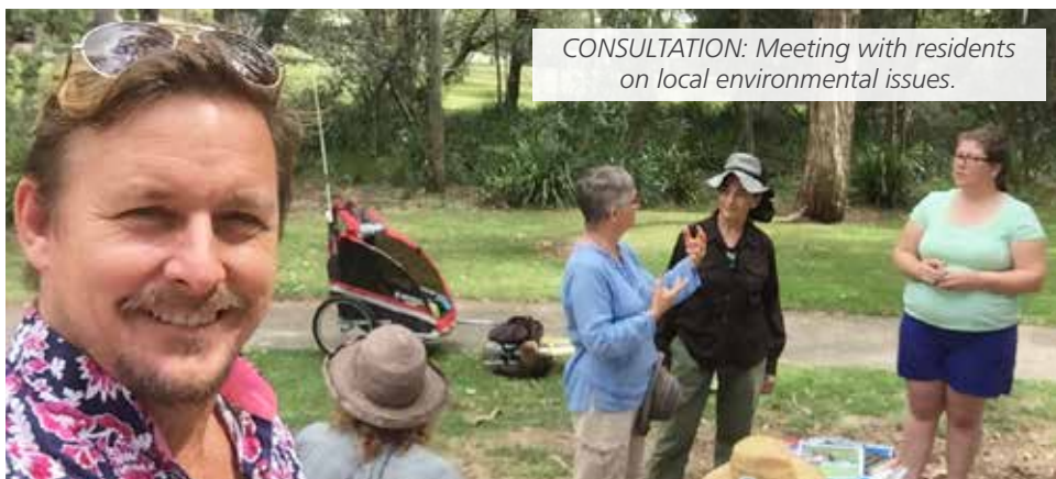
CONSULTATION: Meeting with residents on local environmental issues.

While councils may apply for government funding for upgrades to ensure safe passage for cyclists, motorists and freight, he said only major priorities would receive allocation. While it is good to see that Brisbane City Council has resurfaced much of Rickertt Road, I will continue to campaign for upgrades as a member of the Cross Boundary Connectivity Committee, which aligns all levels of government. Thanks to those who supported the petition.