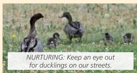
NURTURING: Keep an eye out for ducklings on our streets.

Waterloo Bay is a major feature in our coastal community. When officers recently proposed the construction of a rock wall to manage erosion near Beth Boyd Park on Queens Esplanade, I suggested that there may be other more appropriate options, such as geotextile bags and sand replenishment, given the many activities people enjoy in the area. Consultation is imminent so that officers can ensure future plans will include options that support people's diverse uses, as well as ecological considerations, such as the needs of protected species, coastal shoreline processes and extreme weather events.