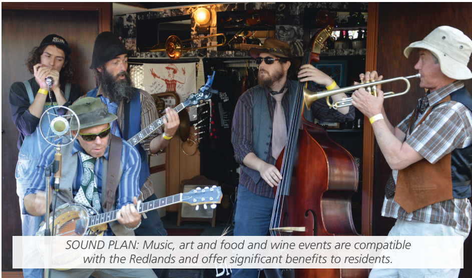
SOUND PLAN: Music, art and food and wine events are compatible with the Redlands and offer significant benefits to residents.