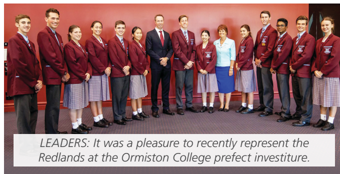
LEADERS: It was a pleasure to recently represent the Redlands at the Ormiston College prefect investiture.