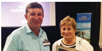
CARING: Bayside Vehicle Restorers Club was a worthy recipient of the Community Organisation Award.