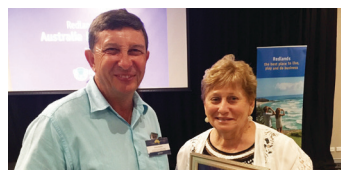
CARING: Bayside Vehicle Restorers Club was a worthy recipient of the Community Organisation Award.