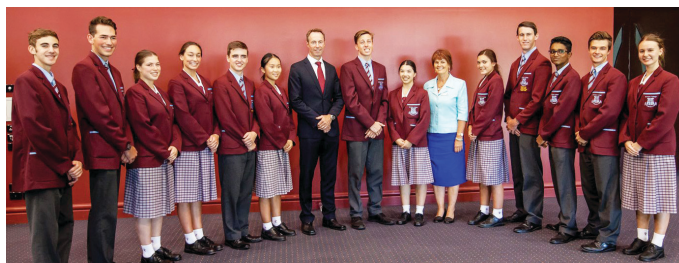
LEADERS: It was a pleasure to recently represent the Redlands at the Ormiston College prefect investiture.