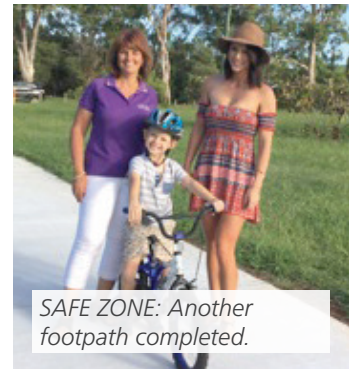
SAFE ZONE: Another footpath completed.

Meanwhile, Raby Bay Esplanade Park has been identified as an ideal site for a canoe-launching pontoon.