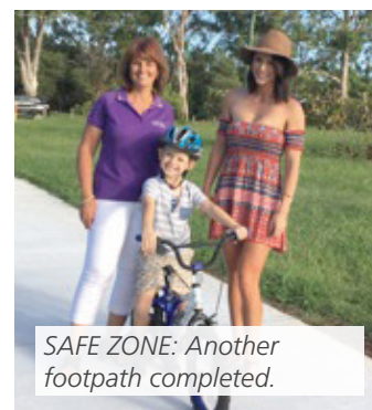
SAFE ZONE: Another footpath completed.

Meanwhile, Raby Bay Esplanade Park has been identified as an ideal site for a canoe-launching pontoon.