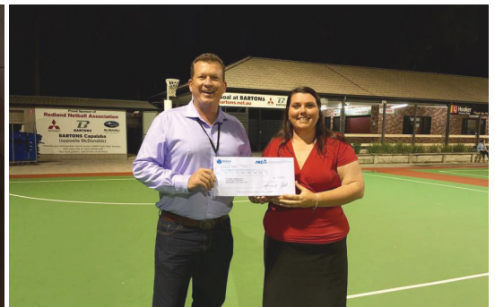
ASSISTANCE: So far I have been able to provide a total of $20,000 to help local sporting, school and community groups .