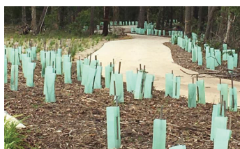
LEGACY: Planting underway at our greenway corridor.

One of the most important projects has been the vital wildlife and recreation corridor through East Thornlands. Following years of patient land use and environmental planning, Council acquired the land to complete the East Thornlands Greenway Corridor and is now working to completely revegetate