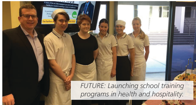
FUTURE: Launching school training programs in health and hospitality.