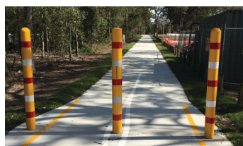
ASSET: The Moreton Bay Cycleway is progressing well.

You can provide your ideas by contacting me or visiting Council's engagement site at yoursay.redland.qld.gov.au .