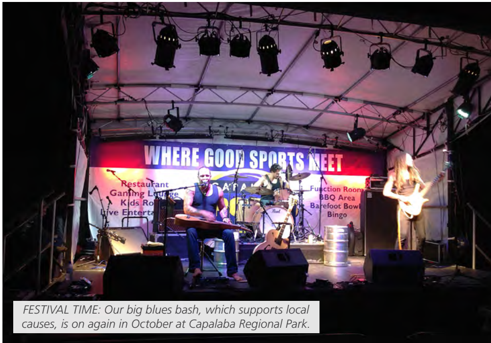
FESTIVAL TIME: Our big blues bash, which supports local causes, is on again in October at Capalaba Regional Park.